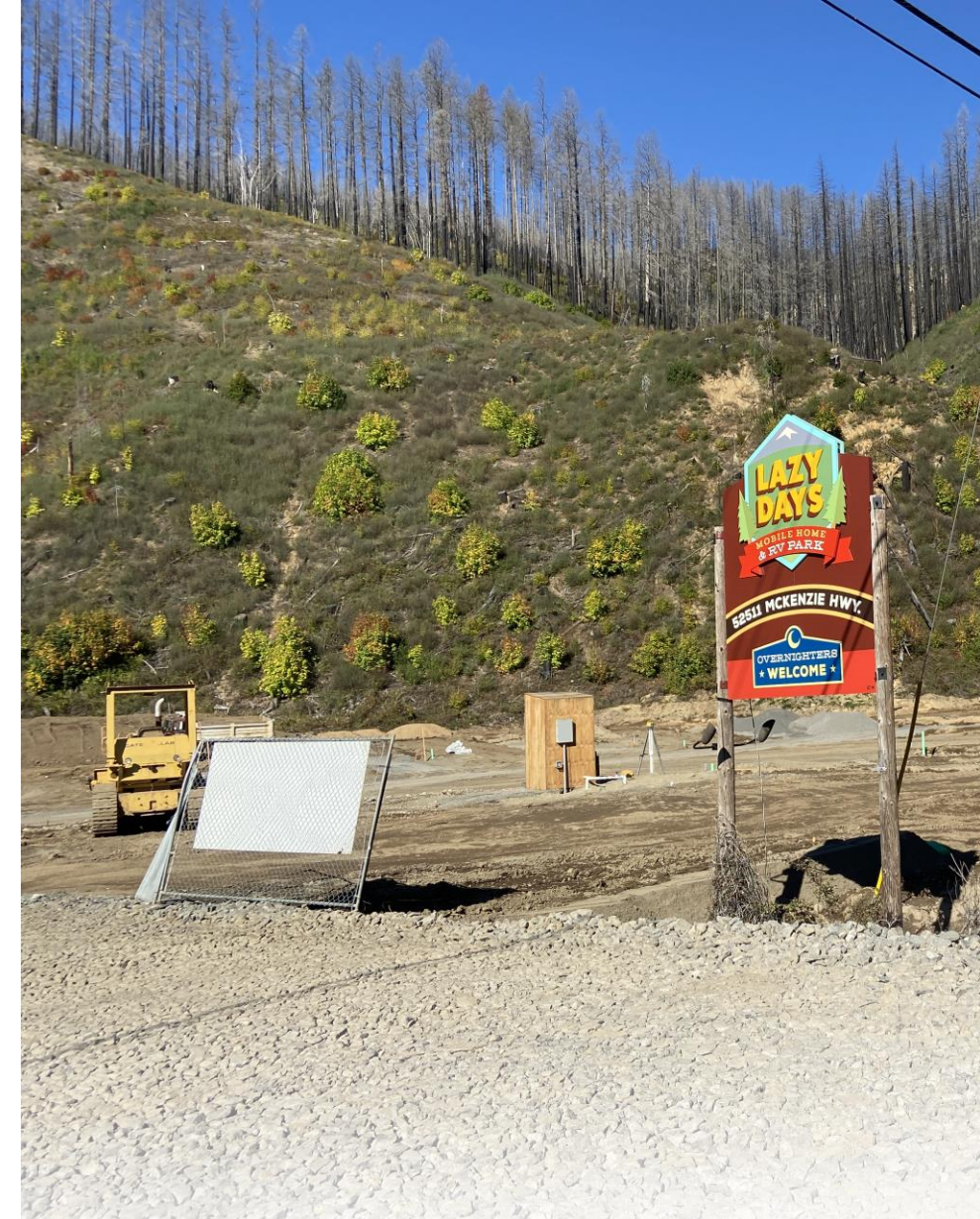
Lazy Days Mobile Home & RV Park