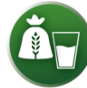
ESF 11 Agriculture, Animals, and Natural Resources