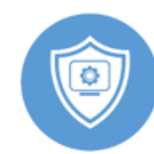
ESF 17 Cyber and Critical Infrastructure Security