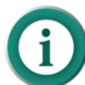
ESF 15 Public Information