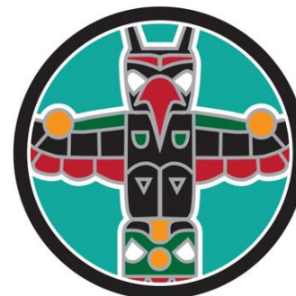
SRF 7 NATURAL & CULTURAL RESOURCES