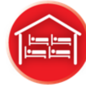
ESF 6 Mass Care