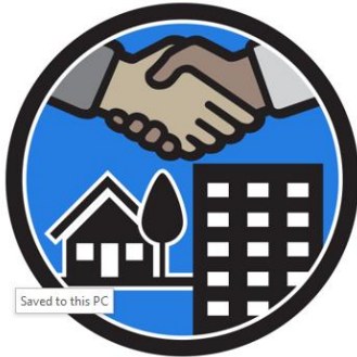
SRF 1 COMMUNITY PLANNING & CAPACITY BUILDING