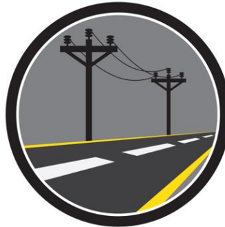
SRF 6 INFRASTRUCTURE SYSTEMS