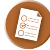
ESF 5 Information and Planning