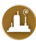
ESF 14 Business and Industry