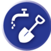
ESF 3 Public Works