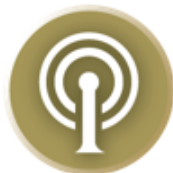
ESF 2 Communications