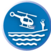
ESF 9 Search and Rescue