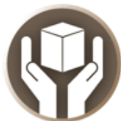
ESF 16 Volunteers and Donations