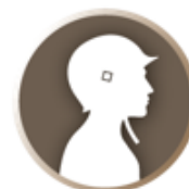
ESF 18 Military Support