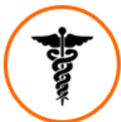
ESF 8 Health and Medical