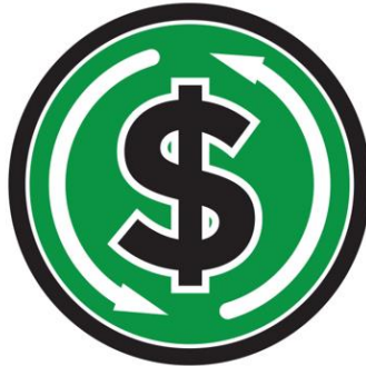
SRF 2 ECONOMIC RECOVERY