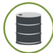
ESF 10 Hazardous Materials