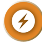
ESF 12 Energy