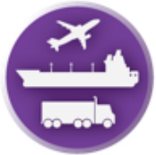
ESF 1 Transportation