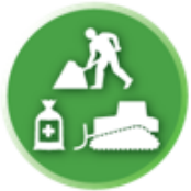
ESF 7 Logistics Management and Resource Support