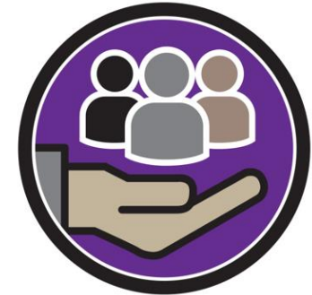
SRF 4 SOCIAL SERVICES