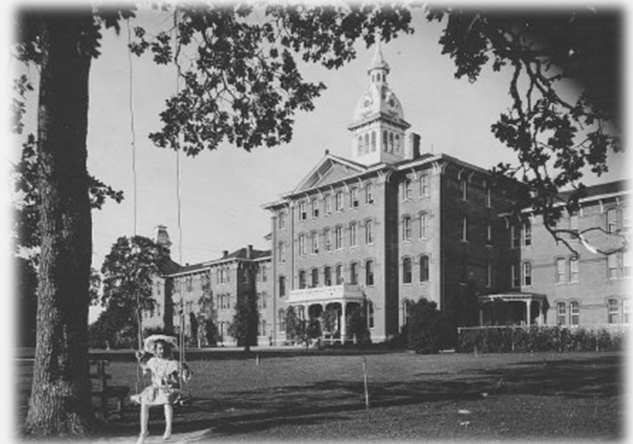
Oregon State Hospital | Mental Health Association of Portland