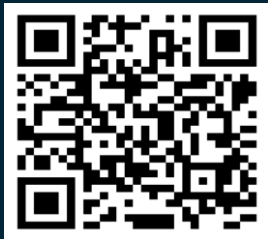
Homeless Veterans Landing Page - ODVA