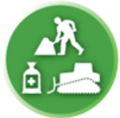
ESF 7 Logistics Management and Resource Support