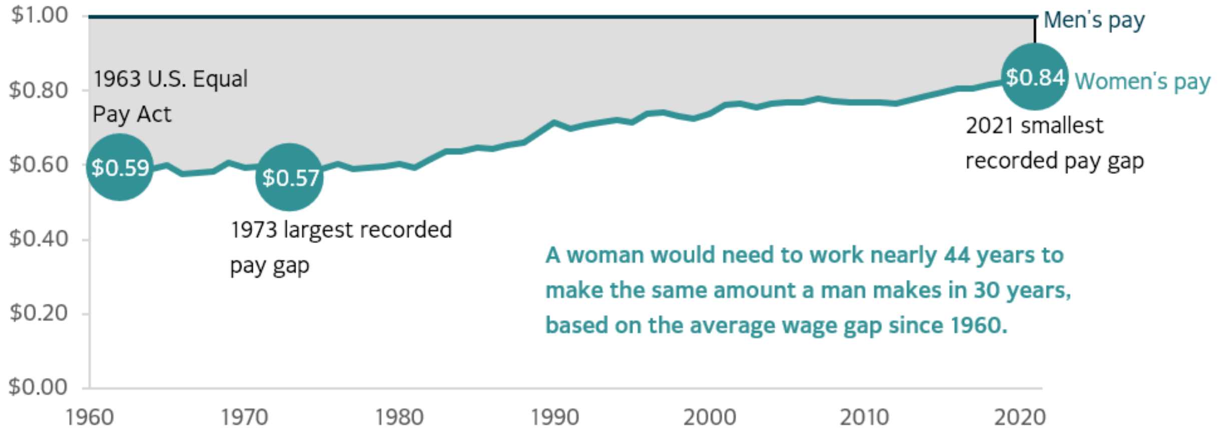
Figure 2: In the nearly 60 years since the federal Equal Pay Act was passed, the gender pay gap has narrowed but still remains

Source: Auditor created based on Current Population Survey data provided by the US Census Bureau. Number of real median earnings of total workers and full-time, year-round workers by sex and female-to-male earnings ratio, 1960 to 2021.