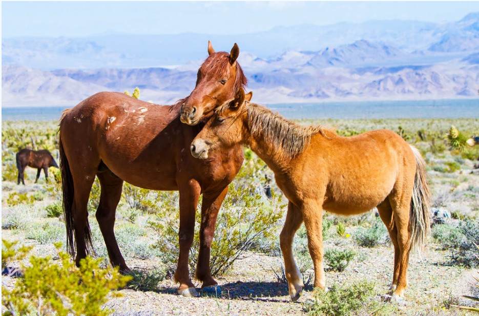
Oregon Department of Education

Michael.S.Elliott@ode.oregon.gov | 503-551-9227