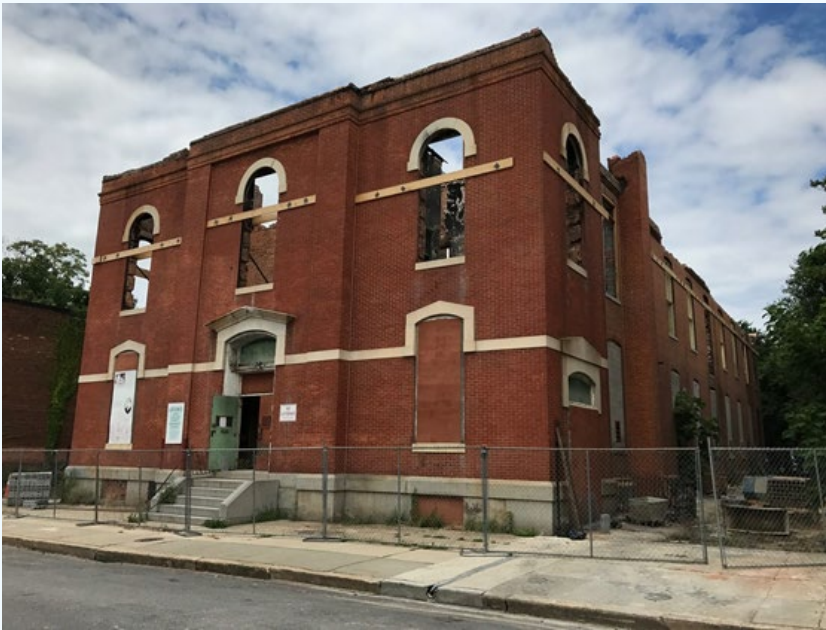
Oregon Department of Education