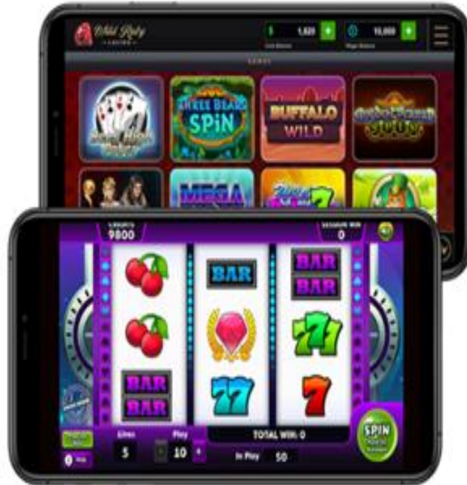
Screenshots from Wild Ruby Casino website