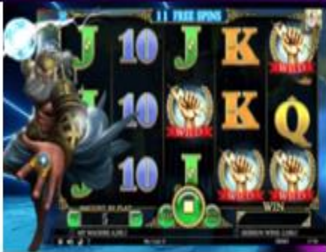
Screenshots from b spot website