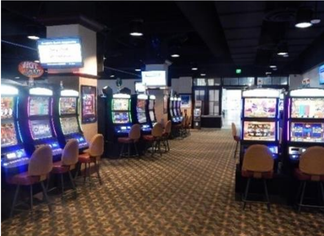
HHR machines at Portland Meadows