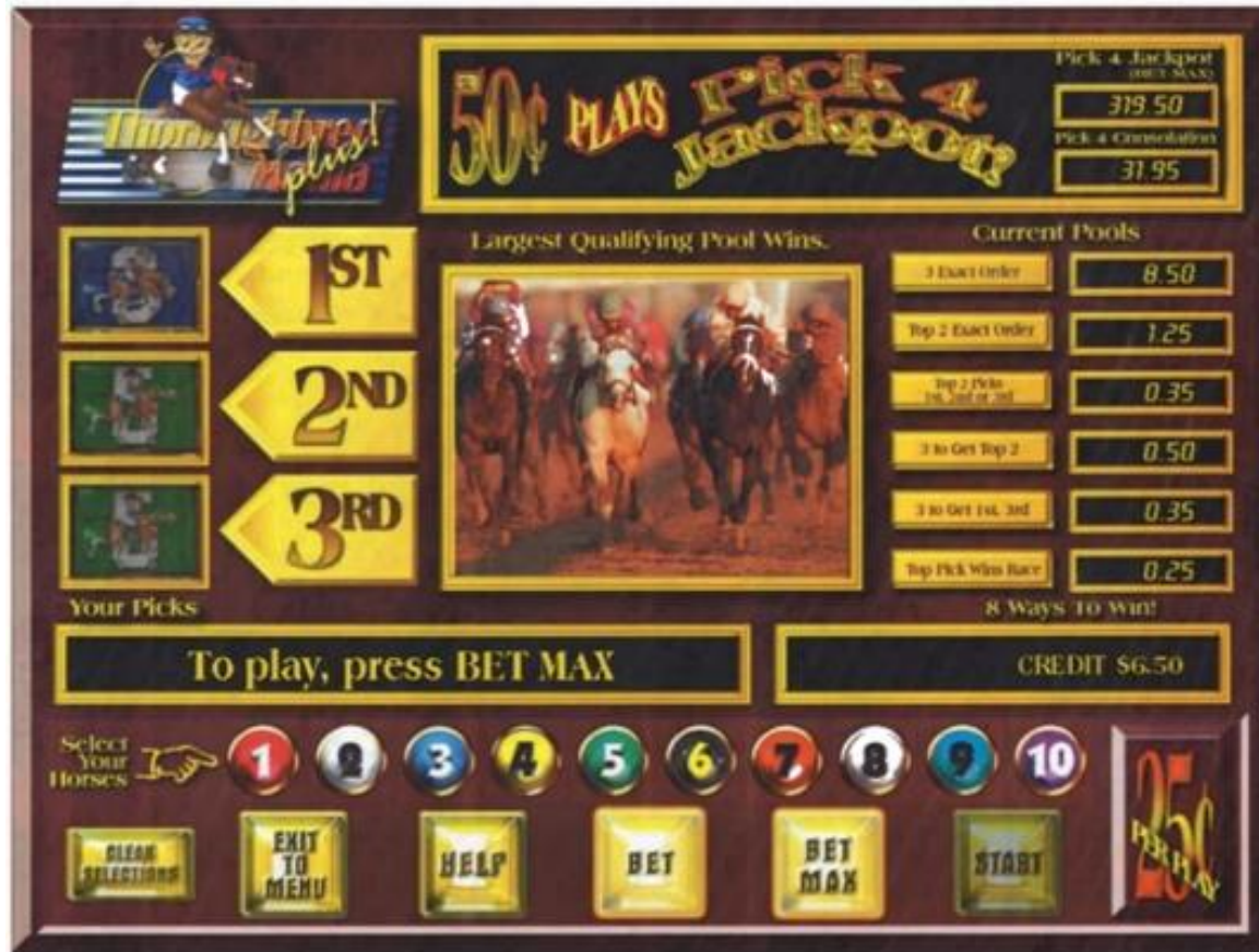
Thoroughbred Mania HHR game screenshot