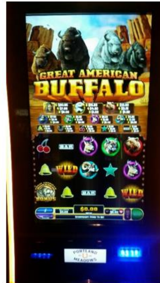
Buffalo Downs HHR game at Portland Meadows in 2017