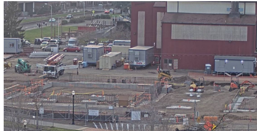
Foundations being placed, Feb 2022