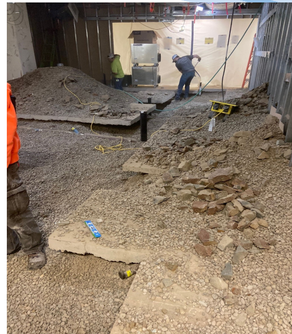
Huestis Basement, Feb 2022