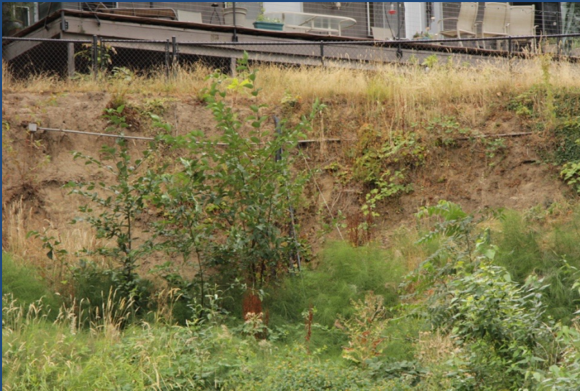
Water Caused Bank Failure