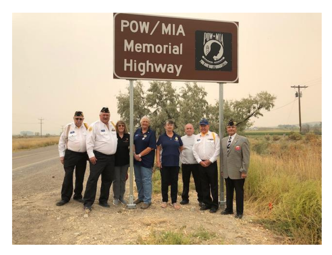
POW/MIA MEMORIAL HIGHWAY U.S. HWY 26