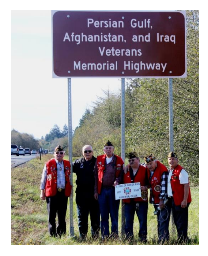
PERSIAN GULF, AFGHANISTAN, IRAQ VETERANS MEMORIAL HIGHWAY U.S. HWY 101