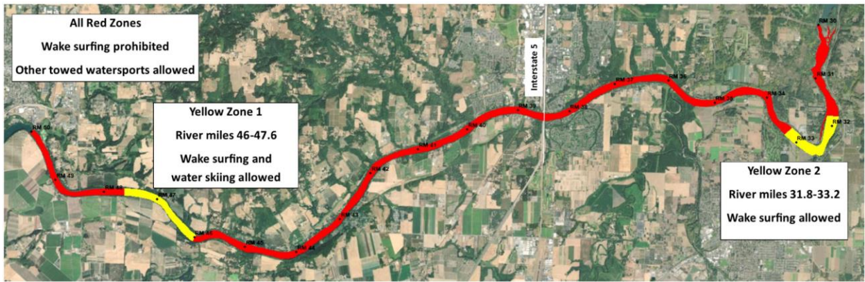
Figure 1. Newberg Pool Special Rules Map

In October 2019, OSMB adopted rules establishing a 10,000-lb maximum loading weight (MLW; OSMB defined motorboat loading weight to be "the sum of the boat's dry weight and the boat's factory ballast capacity") limit for applicants seeking certification to engage in towed watersports.<sup>3</sup> Any boat with a loading weight over 10,000 lbs is ineligible to receive the decal and therefore cannot be used for wakesports in the Newberg Pool. Starting in January 2020, OSMB began issuing Towed Watersports Motorboat Certificates for watercraft under 10,000 lbs. In May 2020, OSMB adopted rules restricting wakesurfing to approximately three miles of the Newberg Pool in a section without any residential docks (referred to as Yellow Zones 1 and 2; Figure 1).