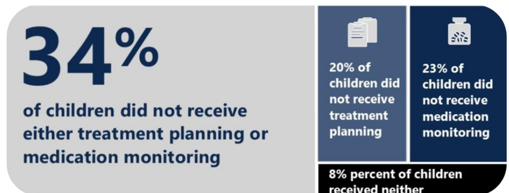
Exhibit 1: One in three children in foster care who were treated with psychotropic medications did not receive required treatment planning or medication monitoring

Thirty-four percent of children in foster care who were treated with psychotropic medications, in the five States we reviewed, did not receive either treatment planning or medication monitoring (see Exhibit 1). Eight percent of these children received neither treatment planning nor medication monitoring. Treatment planning and effective medication monitoring are imperative because of the risks of inappropriate treatment and inappropriate prescribing practices (e.g., too many medications, incorrect dosage, incorrect duration, incorrect indications for use). See Appendix C for more information regarding States' compliance with each requirement we reviewed.