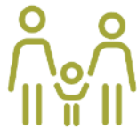
REBUILD AFTER INCARCERATION