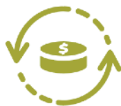
REINVEST IN COMMUNITIES