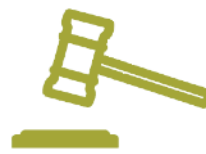
REFORM MANDATORY MINIMUMS