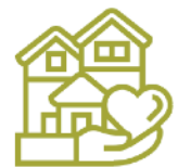
HOUSING AND HEALTHCARE

BY THE END OF THE 2021-23 BIENNIUM, JUSTICE REINVESTMENT IS PROJECTED TO SAVE OREGON OVER $527 MILLION