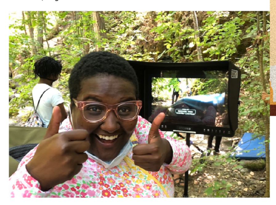
10. Ashland, Oregon