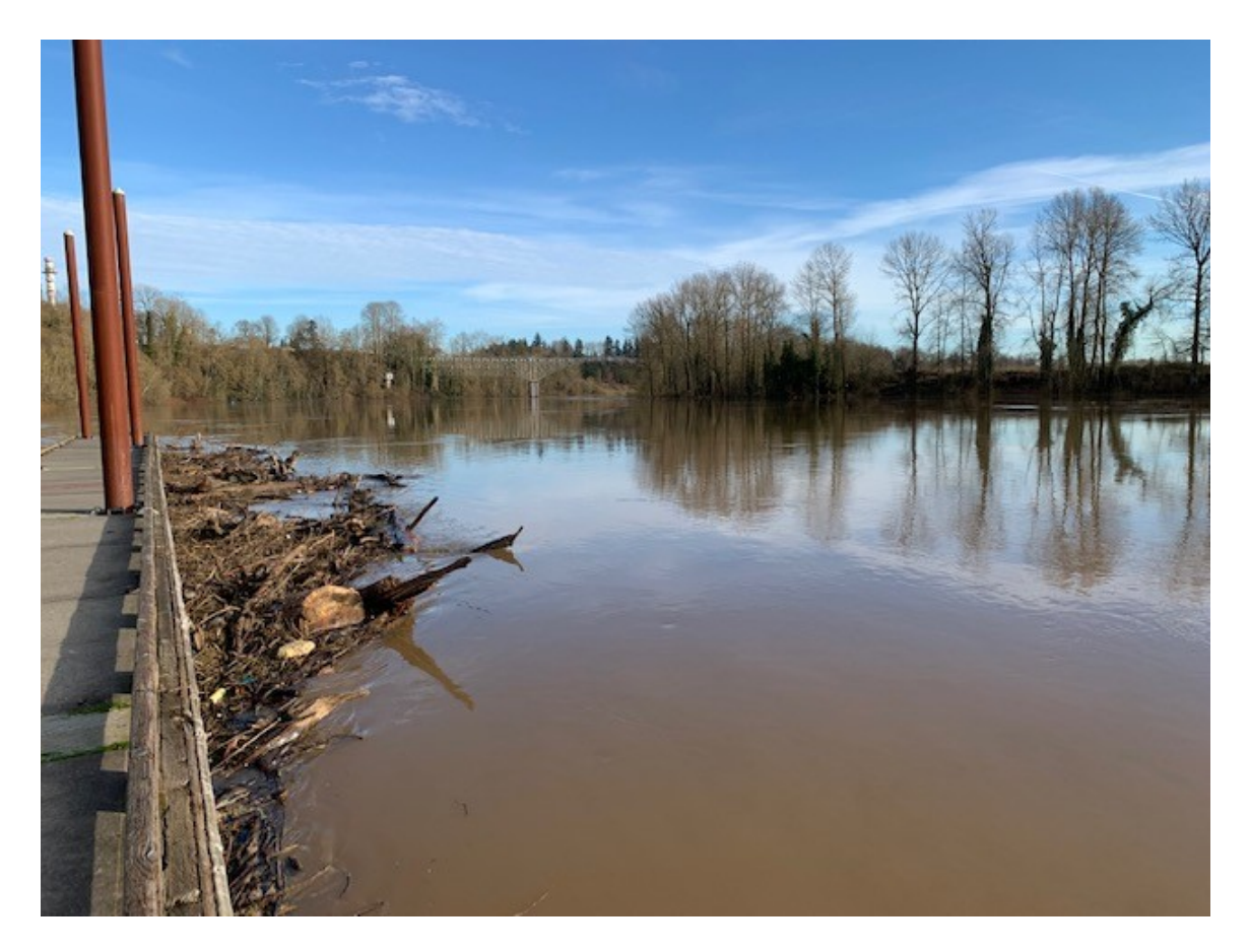
Rogers Landing parking lot and boat ramp – April 26, 2019 (just 2 weeks after April 12<sup>th</sup> pictures below)