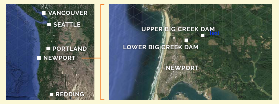
The Big Creek Dams are located in the City of Newport, on Oregon's Central Coast.