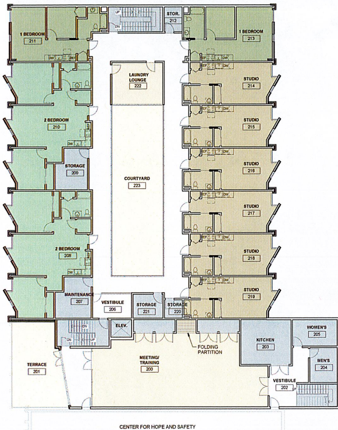
CENTER FOR HOPE AND SAFETY

Two floors of housing units for survivors and their families.