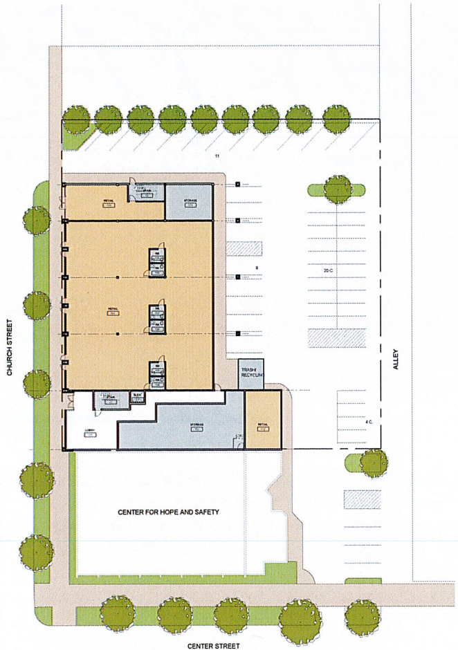
FIRST FLOOR SCALE: 1/8" = 1'-0"

Or visit our website at www.hopeandsafety.org