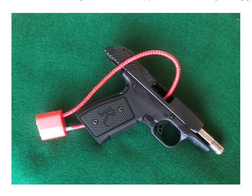
Cable lock on 9mm handgun. Using a cable lock this way, you know that the handgun is completely unloaded and can't be fired.