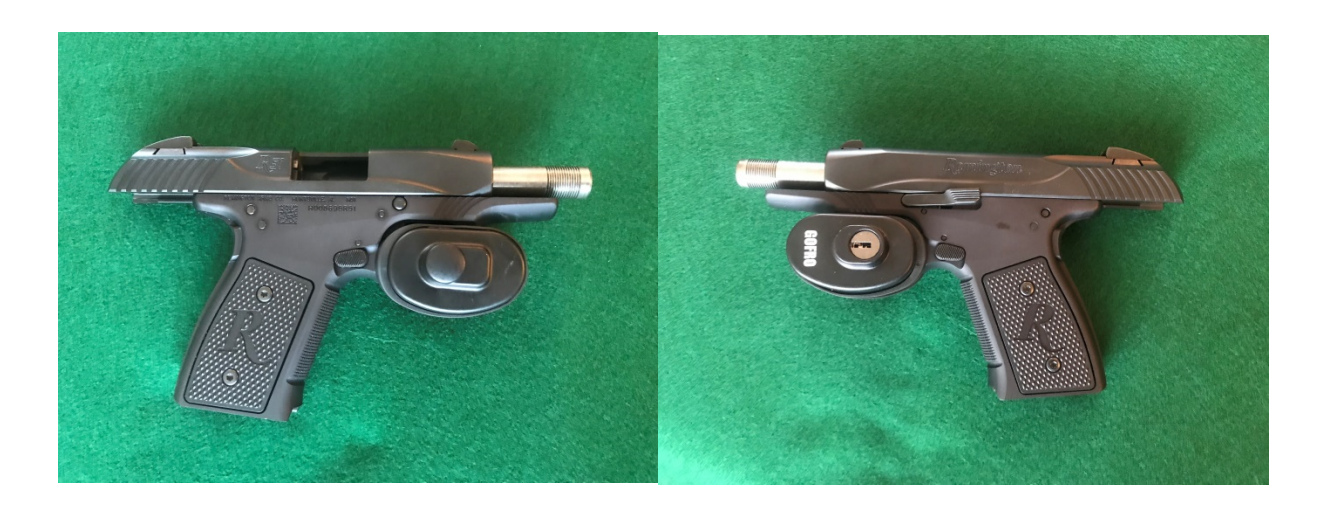
Keyed trigger lock on 9mm handgun