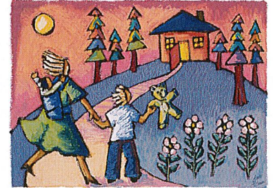
Formerly Mid-Valley Women's Crisis Service

I have worked at the Center for Hope & Safety for five years and I have seen the difference flexible housing funds can make for survivors of violence. Before the Housing Navigator funds became available... Since receiving the Housing Navigator funds in 2019, I have seen hopefulness increase among clients and my peer workers by seeing these families succeed despite the overwhelming number of barriers survivors face. And when working with minorities like women of color the barriers are even more so being able to get them in to safe affordable housing is very rewarding.