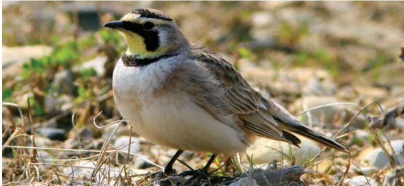
HORNED LARK, PHOTO BY KENNETH COLE SCHNEIDER, FLICKR

For small passerine species, current turbine-related fatalities constitute a very small percentage of their total population