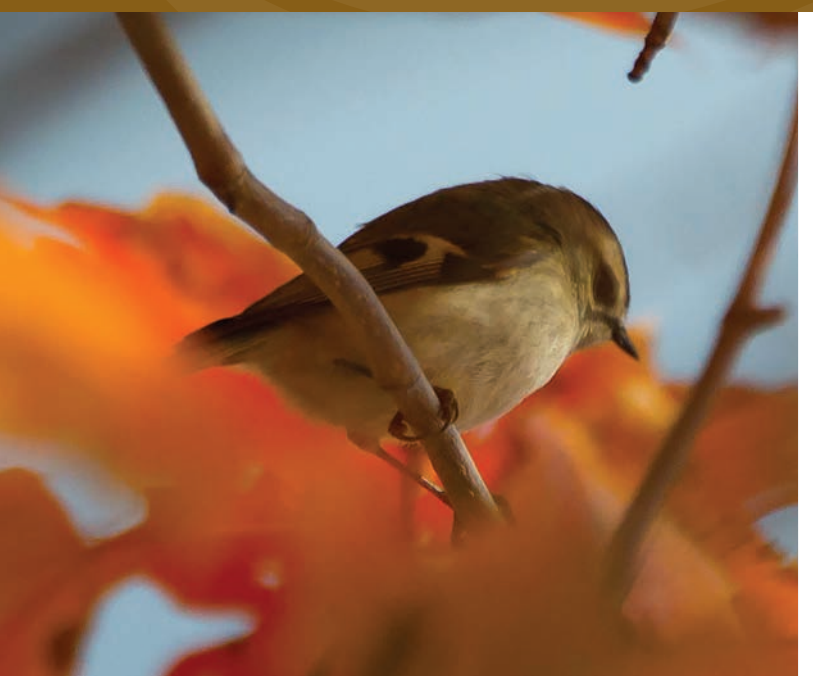
GOLDEN-CROWNED KINGLET, PHOTO BY ZANATEH, FLICKR