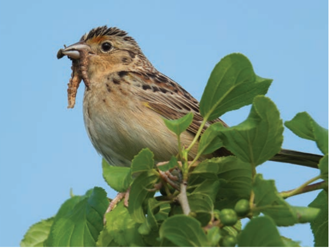
GRASSHOPPER SPARROW

Construction of single utility-scale turbines (1.5-2 MW) is growing rapidly in some regions of the country, especially where opportunities for large utility-scale projects are limited or municipalities supply their own electricity (e.g., Massachusetts). Fatality monitoring at single-turbine facilities is often not required, and published reports have not been available.