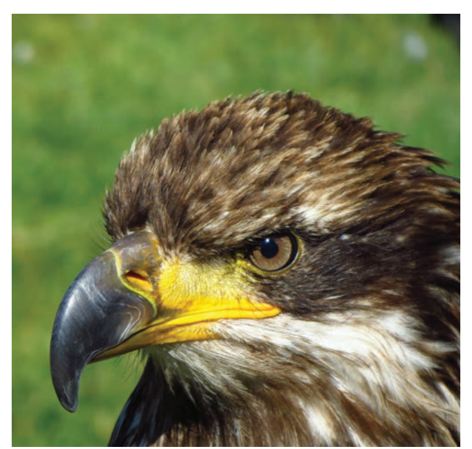
JUVENILE BALD EAGLE

Fatalities of waterbirds and waterfowl and other species