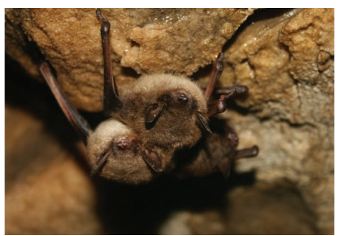
LITTLE BROWN BATS