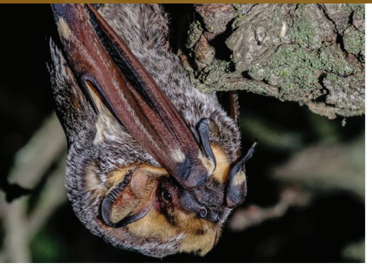
HOARY BAT