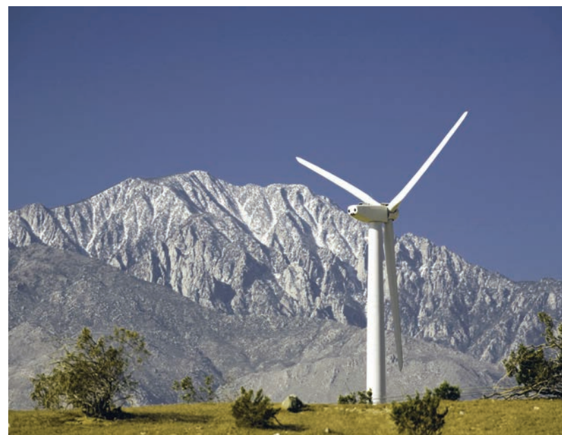
DILLON WIND POWER PROJECT, PHOTO BY IBERDROLA RENEWABLES, INC., NREL 16105

Substantial effort is made to estimate collision risk of birds and bats prior to the siting, construction, and operation of wind energy facilities under the premise that high-activity sites will pose an unacceptable risk to these species and