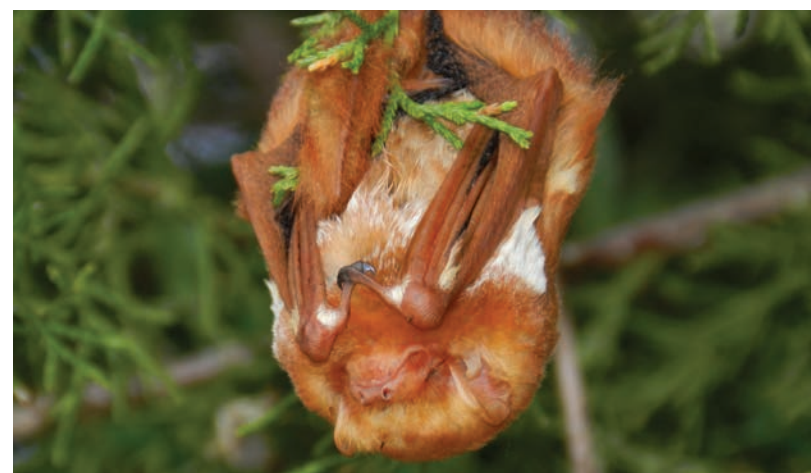
EASTERN RED BAT

Mexican free-tailed bat, one of the most abundant bat species in the U.S. (Harvey et al. 2011), constitutes a substantial proportion (41–86%) of the estimated number of bats killed at wind facilities within this species' range, which covers most of the southern half of the U.S. (Arnett et al. 2008; Miller 2008; Piorkowski and O'Connell 2010). As with the tree-roosting bats, why Mexican free-tailed bats account for such a high percentage of fatalities remains uncertain.