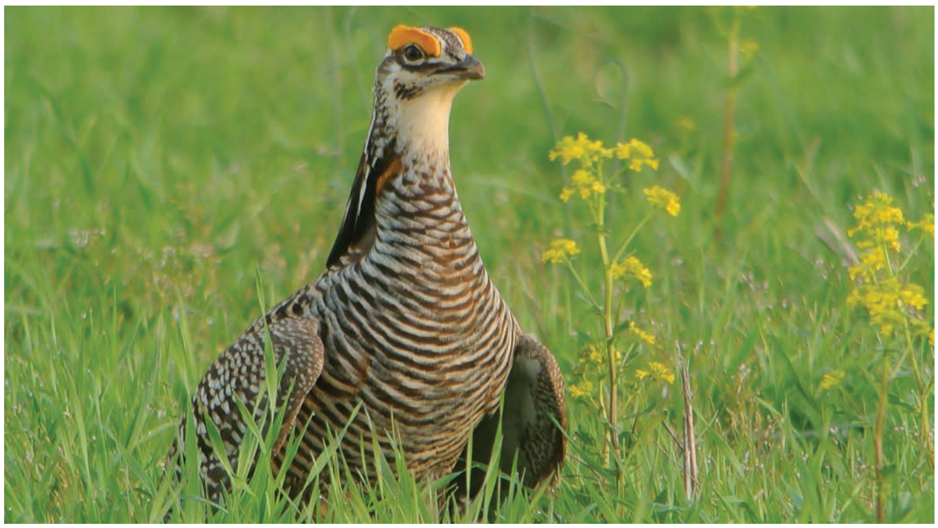
GREATER PRAIRIE-CHICKEN

There is concern that prairie-chickens, sharp-tailed grouse, and greater sage-grouse will avoid wind energy facilities because of disturbance or because they perceive turbine towers as perches for avian predators.