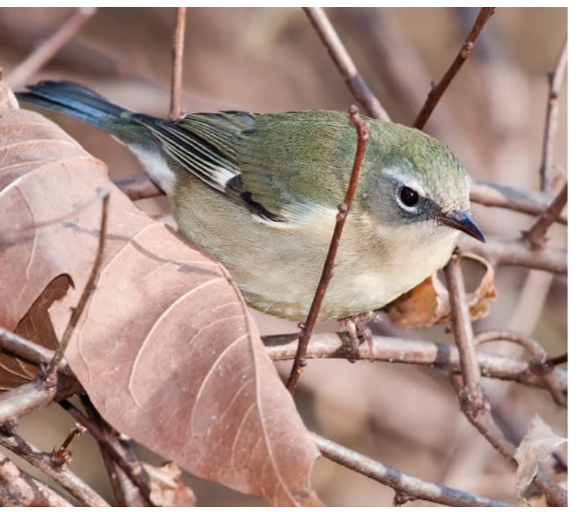
BLACK THROATED BLUE WARBLER

This section outlines what is known and where there is remaining uncertainty about the patterns of bird and bat collision fatalities, particularly in the continental U.S. We first examine patterns that apply to both birds and bats, and then describe patterns specific to either birds or bats.