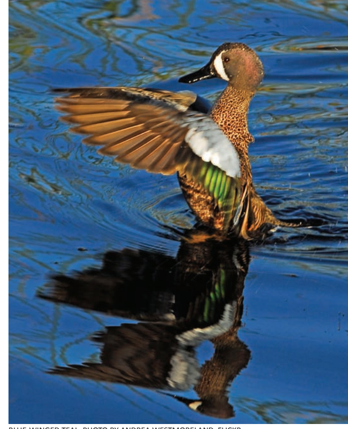
BLUE-WINGED TEAL, PHOTO BY ANDREA WESTMORELAND, FLICKR