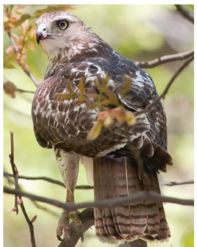
JUVENILE RED-TAILED HAWK

Automated systems can successfully detect and classify eagles in the vicinity of a wind project, and are able to detect large birds at far greater distances than human observers (McClure et al. 2018). Ongoing research will test the ability of camera-based systems to track eagles in flight, determine when they are at risk of colliding with a turbine, and issue successful curtailment orders.