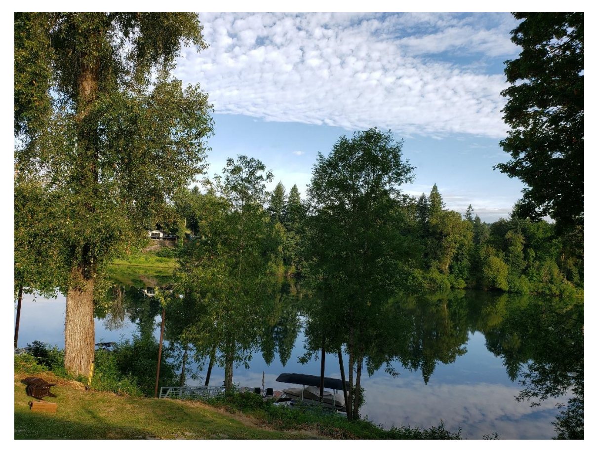
September 2020 – Upper Willamette – Newberg Pool - Butteville Road NE Aurora, OR

July 2020 – Upper Willamette River – Newberg Pool – Butteville Road NE Aurora, OR