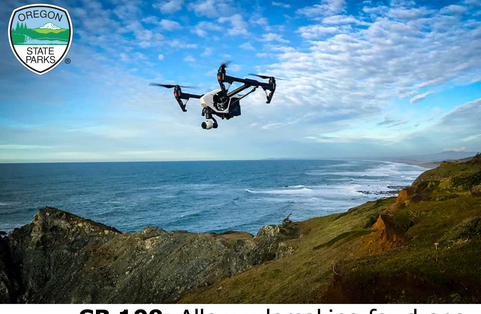
SB 109: Allow rulemaking for drone take-off and landing in State Parks