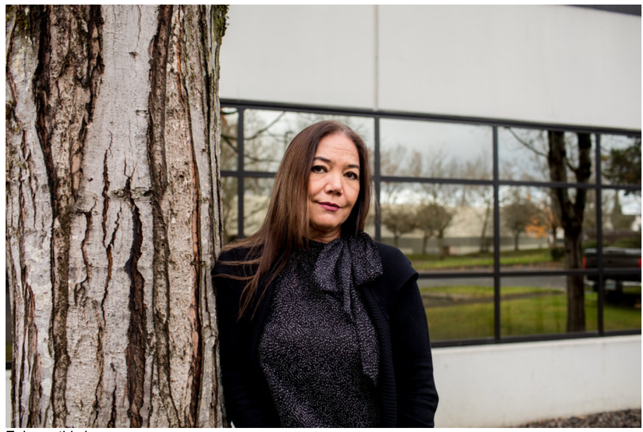
Enlarge this image

They went to the mall and to the movies.