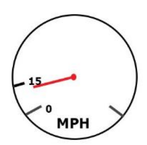
MOTORCYCLE SPEED CANNOT BE MORE THAN 15 MPH WHEN FILTERING