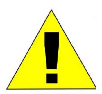
THE MOVEMENT MAY BE MADE SAFELY