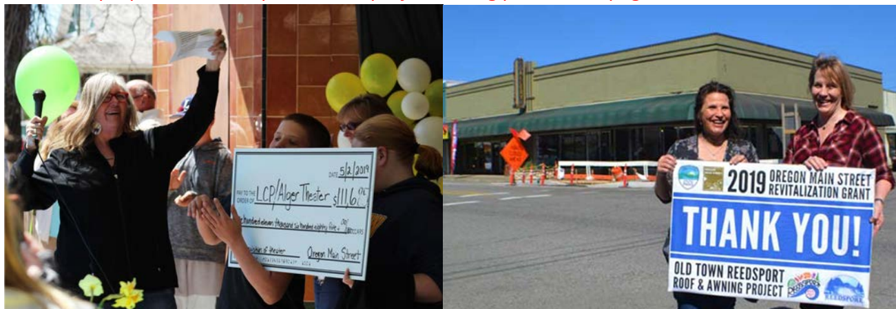
Celebrations in Lakeview and Reedsport!