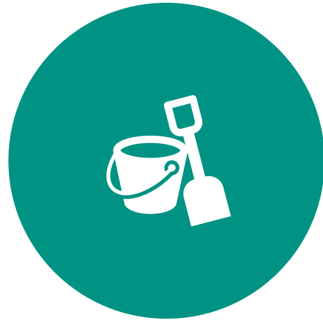
Early Learning and Care