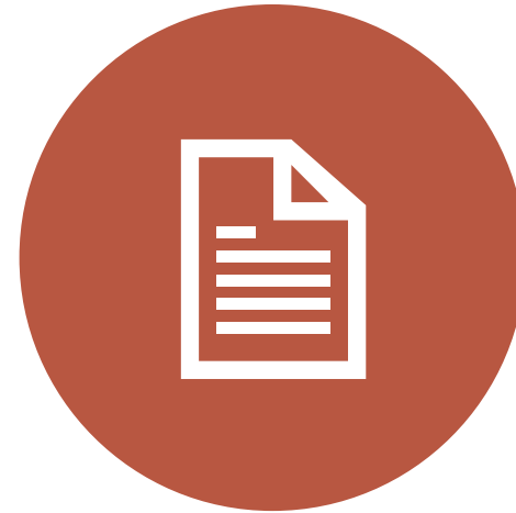
Specially Designed Instruction (SDI)