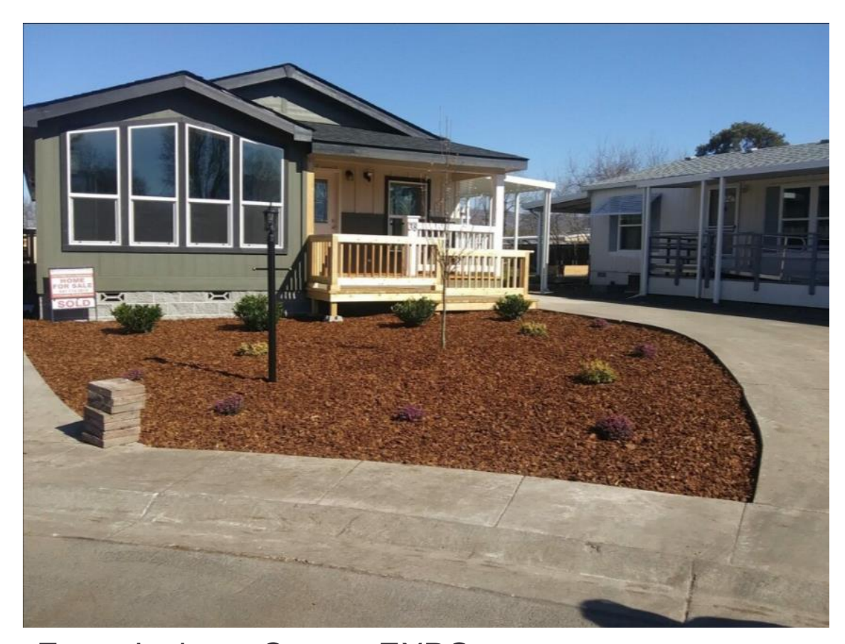
From Jackson County EXPO evacuee to recovered new homeowner