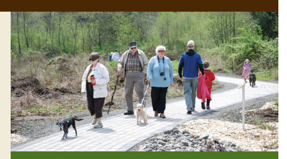
Kilchis Point Preserve Tillamook County

Grants awarded to counties to develop, improve or plan county-operated camping facilities. Funds for these grants come from RV registration fees.