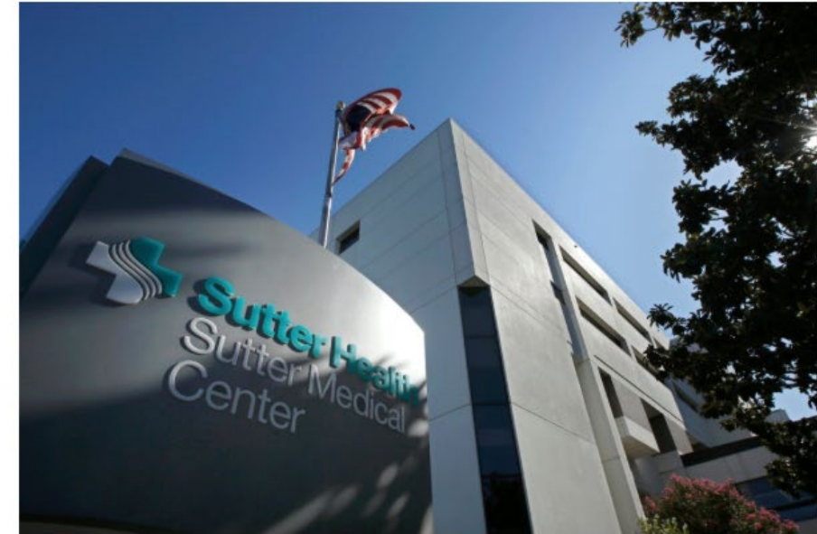
The Sutter Medical Center in Sacramento, part of the vast Sutter Health hospital system in Northern California.

The deal resolves allegations of anti-competitive behavior by the large hospital system in Northern California.