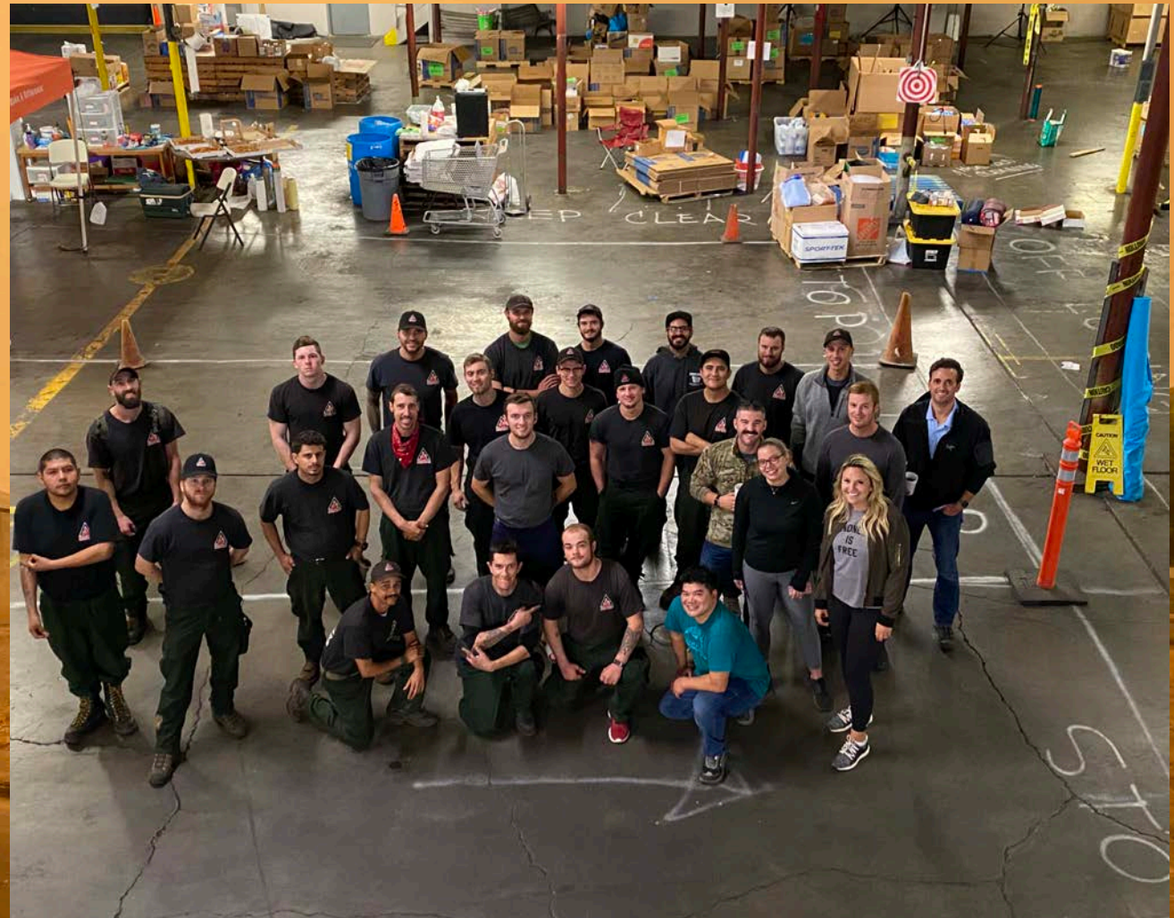
MEALS AND SHELTER PROVIDED FOR A CREW OF 20 YOUNG MEN FOR 10 NIGHTS