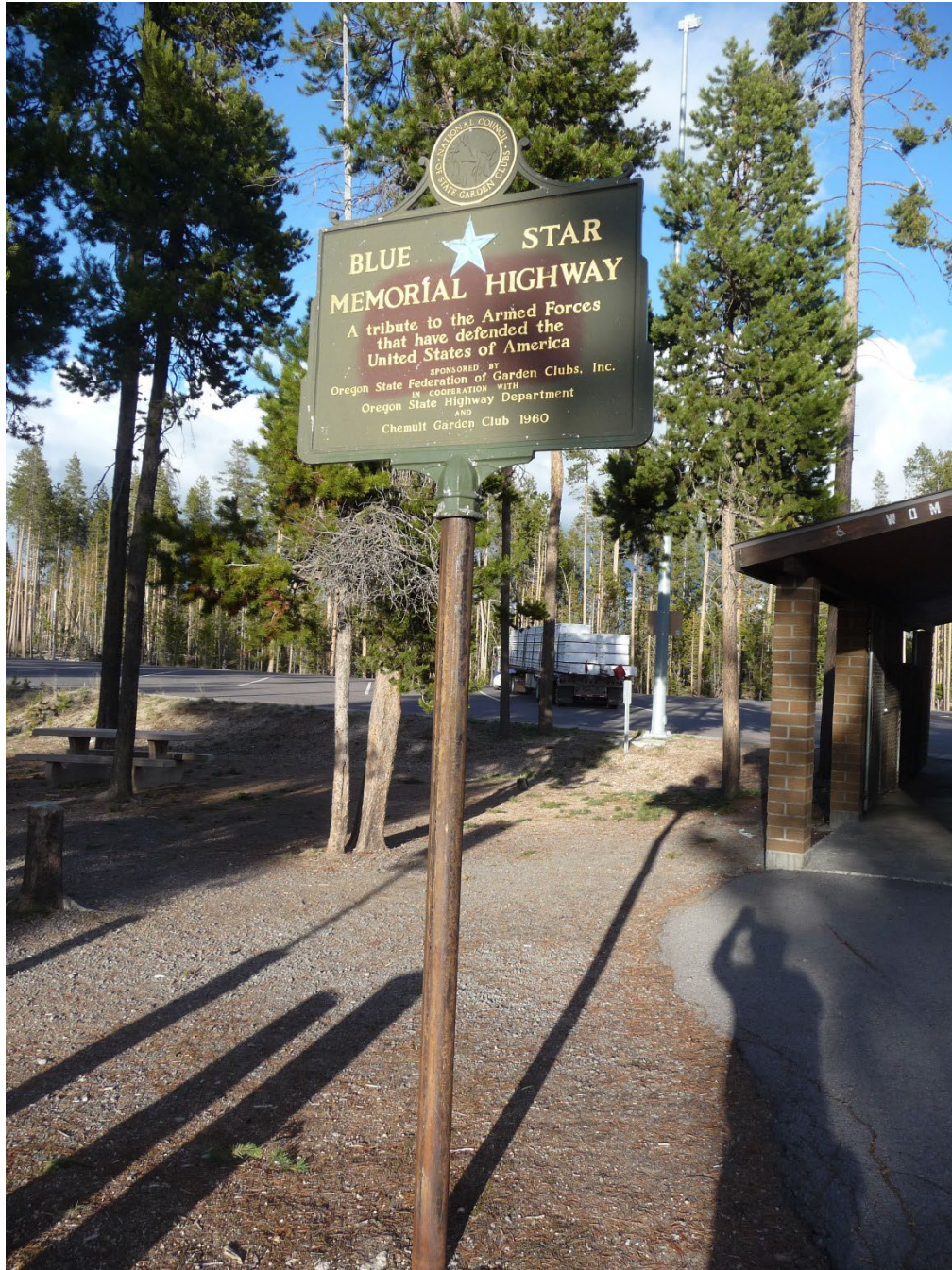
TYPICAL OF 86 BLUE STAR MEMORIAL HIGHWAY SIGNS INSTALLED ACROSS OREGON TYPICALLY IN REST STOPS