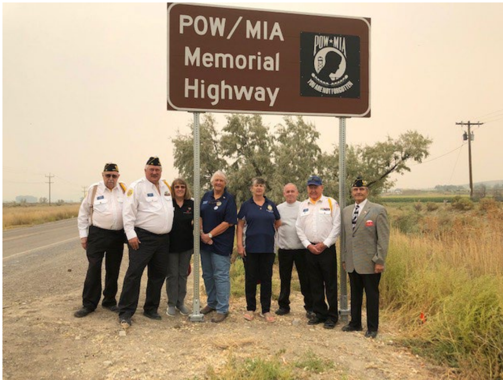
POW/MIA MEMORIAL HIGHWAY U.S. HWY 26