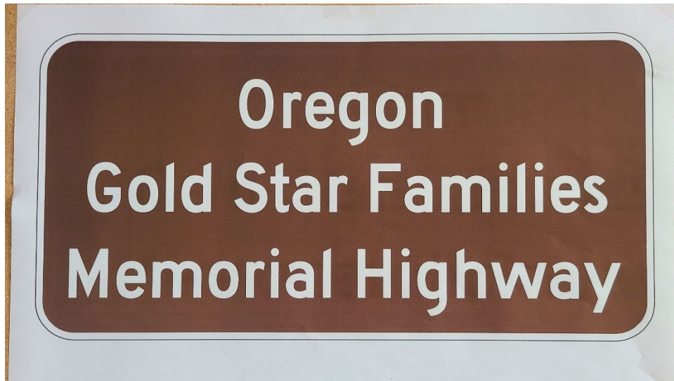
PROPOSED DESIGN FOR 4 FT X 8 FT SIGNS ON US HWY 30 ACROSS OREGON