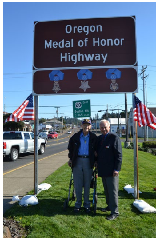
OREGON MEDAL OF HONOR HIGHWAY U.S. HWY 20