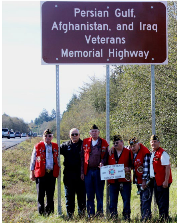
PERSIAN GULF, AFGHANISTAN, IRAQ VETERANS MEMORIAL HIGHWAY U.S. HWY 101