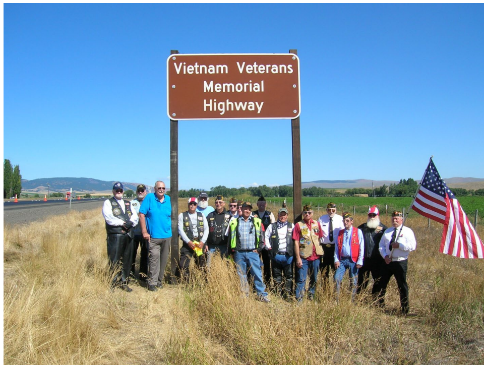
VIETNAM VETERANS MEMORIAL HIGHWAY I-84