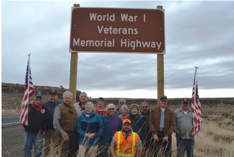
WWI VETERANS MEMORIAL HIGHWAY U.S. HWY 395