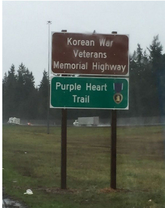
KOREAN WAR HIGHWAY AND PURPLE HEART TRAIL I-5