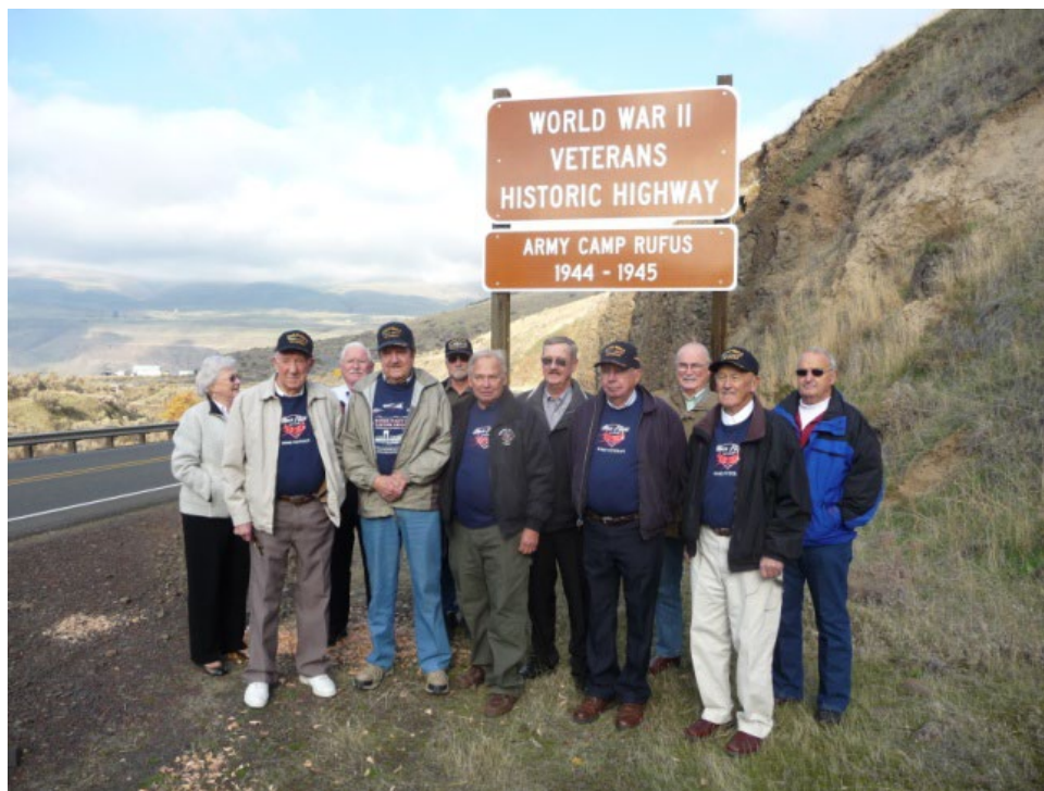
WWII VETERANS HISTORIC HIGHWAY U.S. HWY 97, PORTION S.R. 126