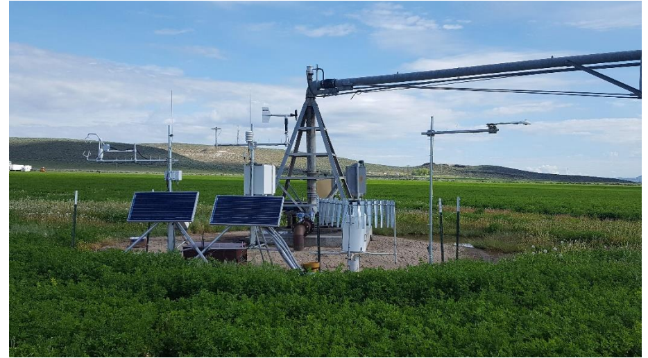
Weather station in Harney County

Over the next year, OWRD will be leading the effort to update the IWRS. Agencies, tribes, stakeholders, and the public will all have an opportunity to contribute to the next IWRS.