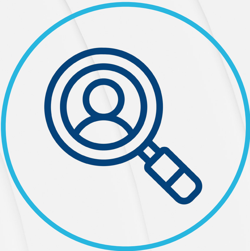
Nationwide labor shortage