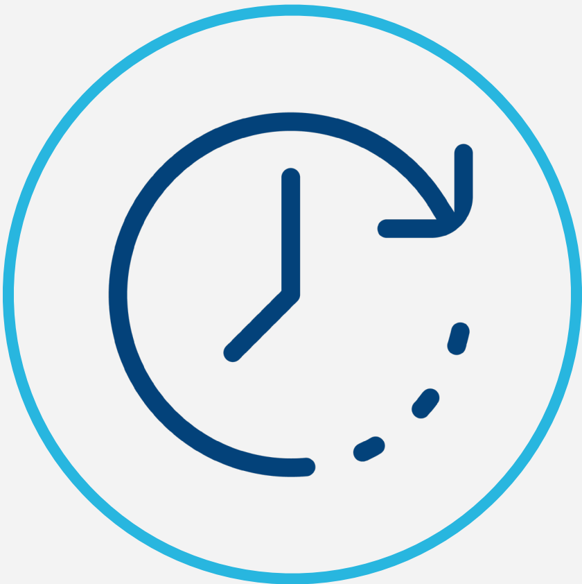
Patient discharge delays