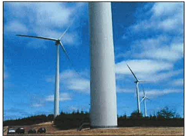
Election results show a new wind energy project has divided northeast Oregon's Union County.

48 percent advised officials to support the project. Overall, with 70 percent turnout, 5,462 people voted against the project and 5,060 voted for it.