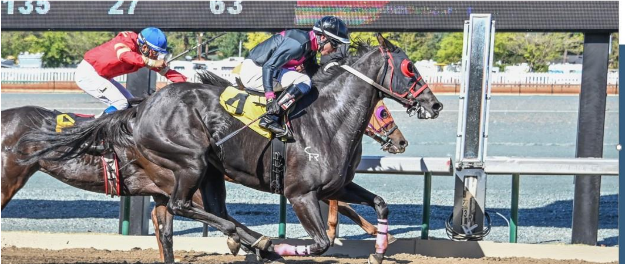
Overview of the Oregon Racing Commission (ORC)