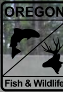
Lava Butte underpass