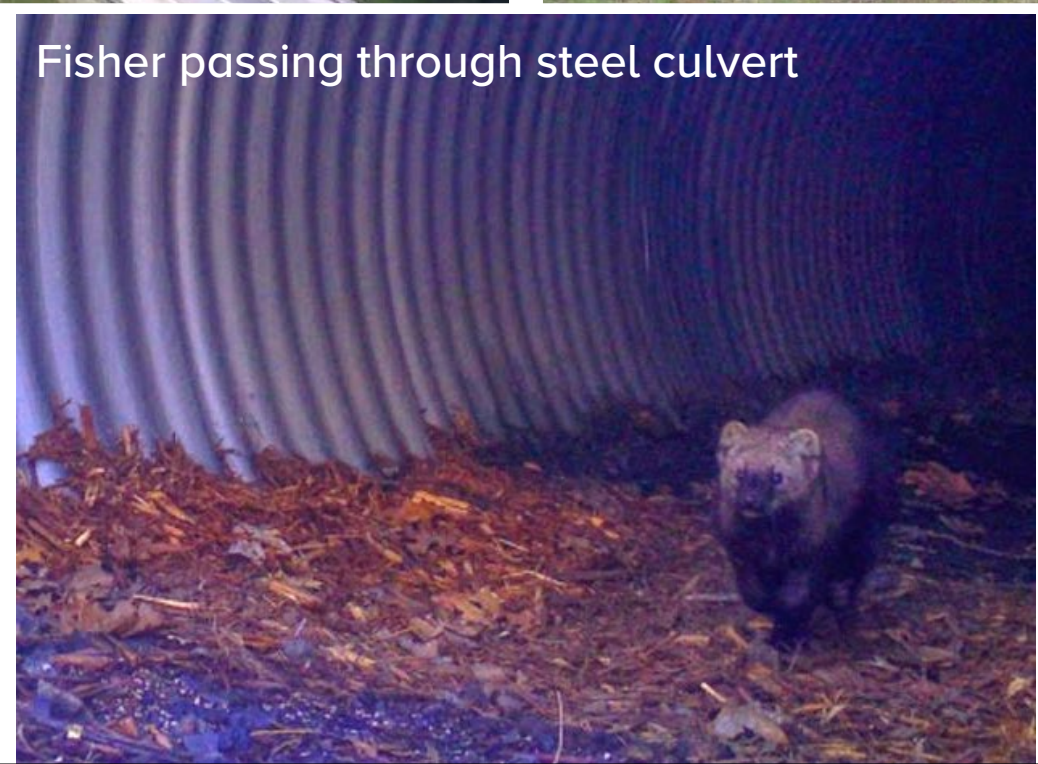
Fisher passing through steel culvert