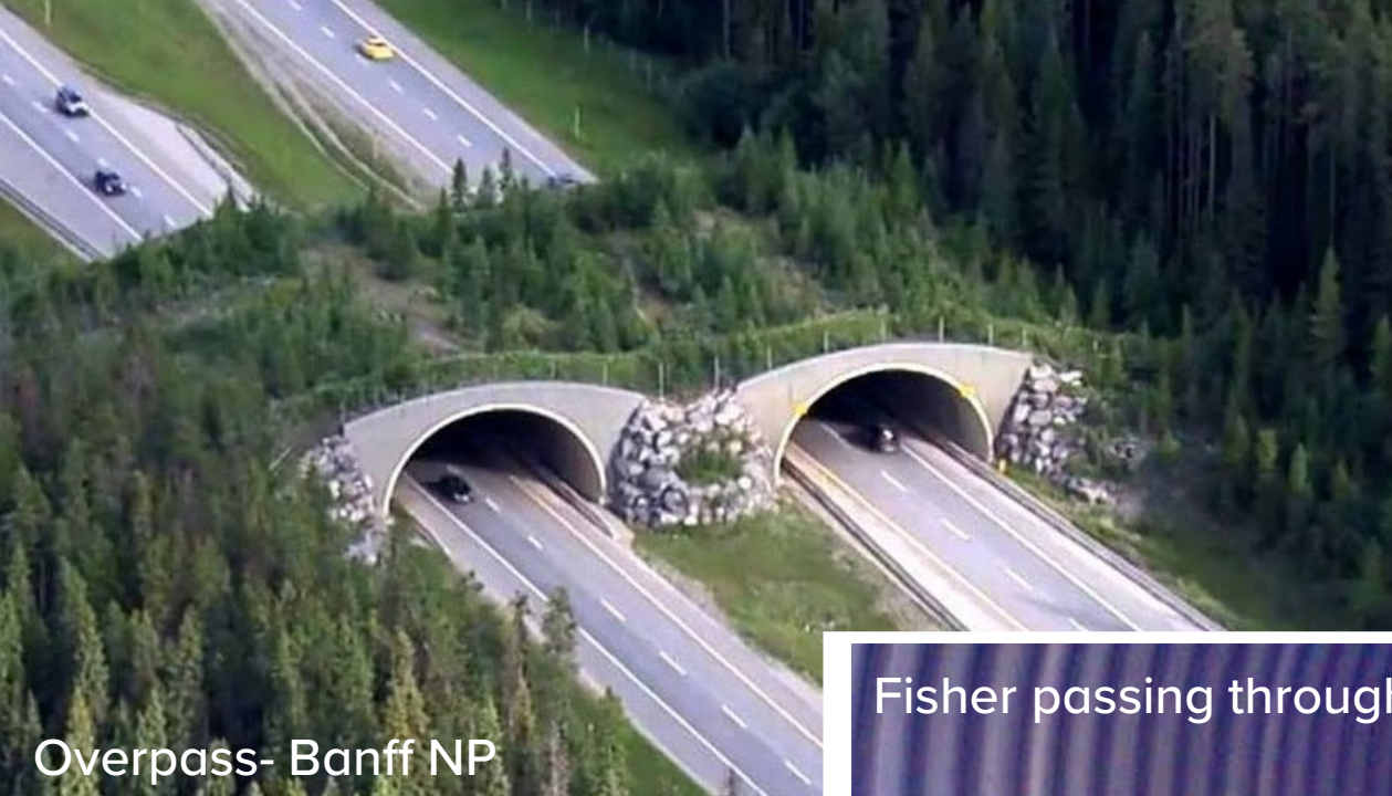
Overpass- Banff NP