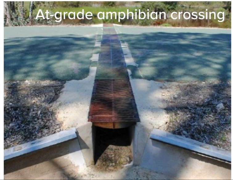
At-grade amphibian crossing