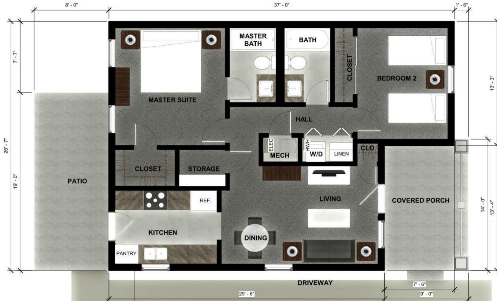
Two Bedroom / Two Bath Plan – 884 sf

Floor Plans vary from One Bedroom at 626 sf to Three Bedroom at 1,076 sf