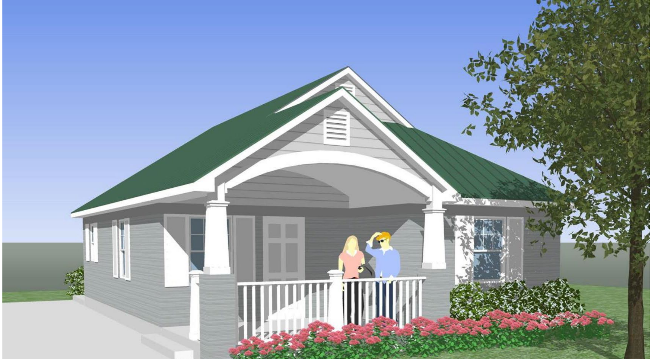
Typical House with front porch and shutters