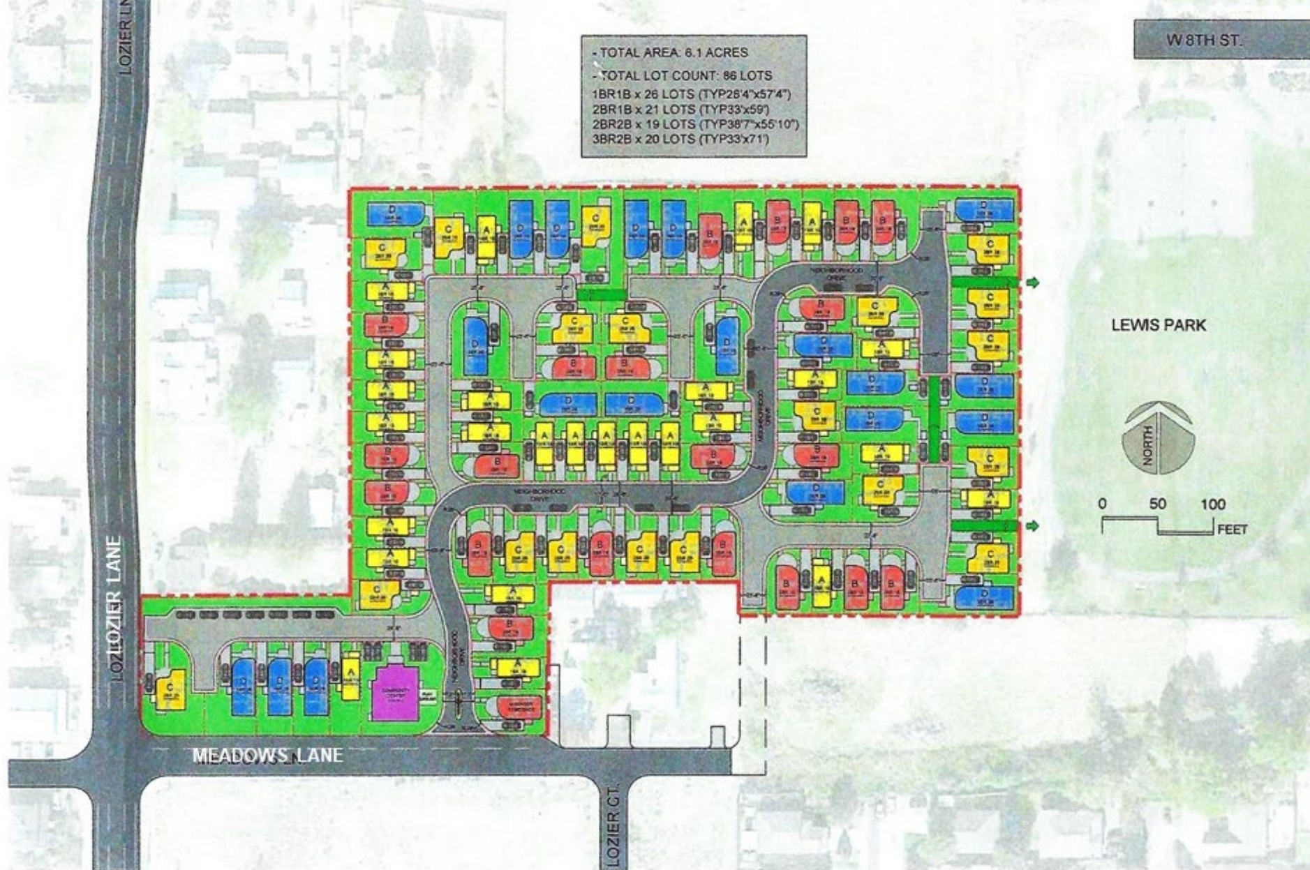
A new neighborhood of 80 homes with a Community Center and private streets