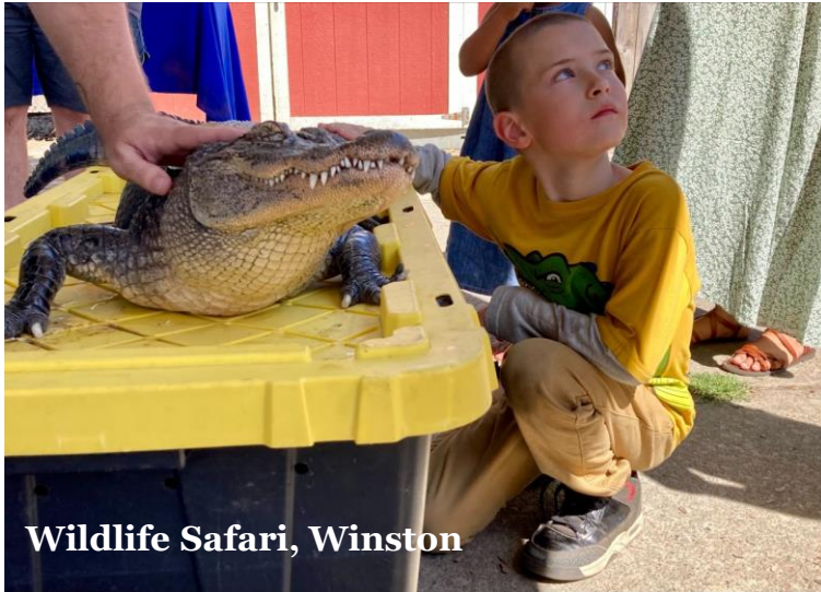
Wildlife Safari, Winston

Research shows that these programs narrow the opportunity gap experienced by marginalized youth and ultimately mitigate related educational disparities.