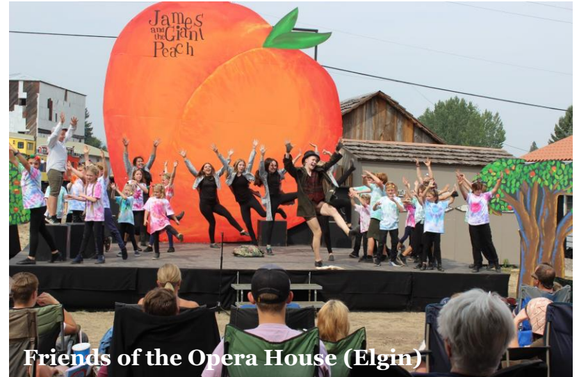
Friends of the Opera House (Elgin)