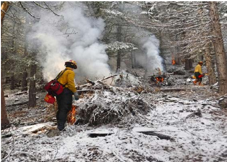
Ecological Thin and Pile Burn

Ecological thinning and pile burning reduced flame length by 50%.