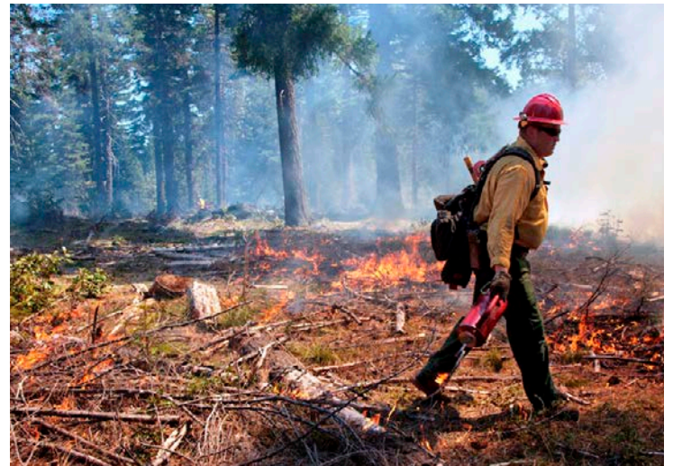
Underburn Following Thinning

Monitoring shows that ecological thinning and subsequent underburn treatments reduce wildfire hazard. These treatments raise the canopy base height and decrease fuels to shorten the predicted flames. Shorter flame lengths are easier to control. Analysis showed a 50% reduction in flame length from thinning and pile burning, which changed the predicted wildfire behavior under dry-windy conditions from uncontrollable to controllable using bulldozers and heavy equipment. In units that were selected for underburning, flame length was reduced by an additional 55%.