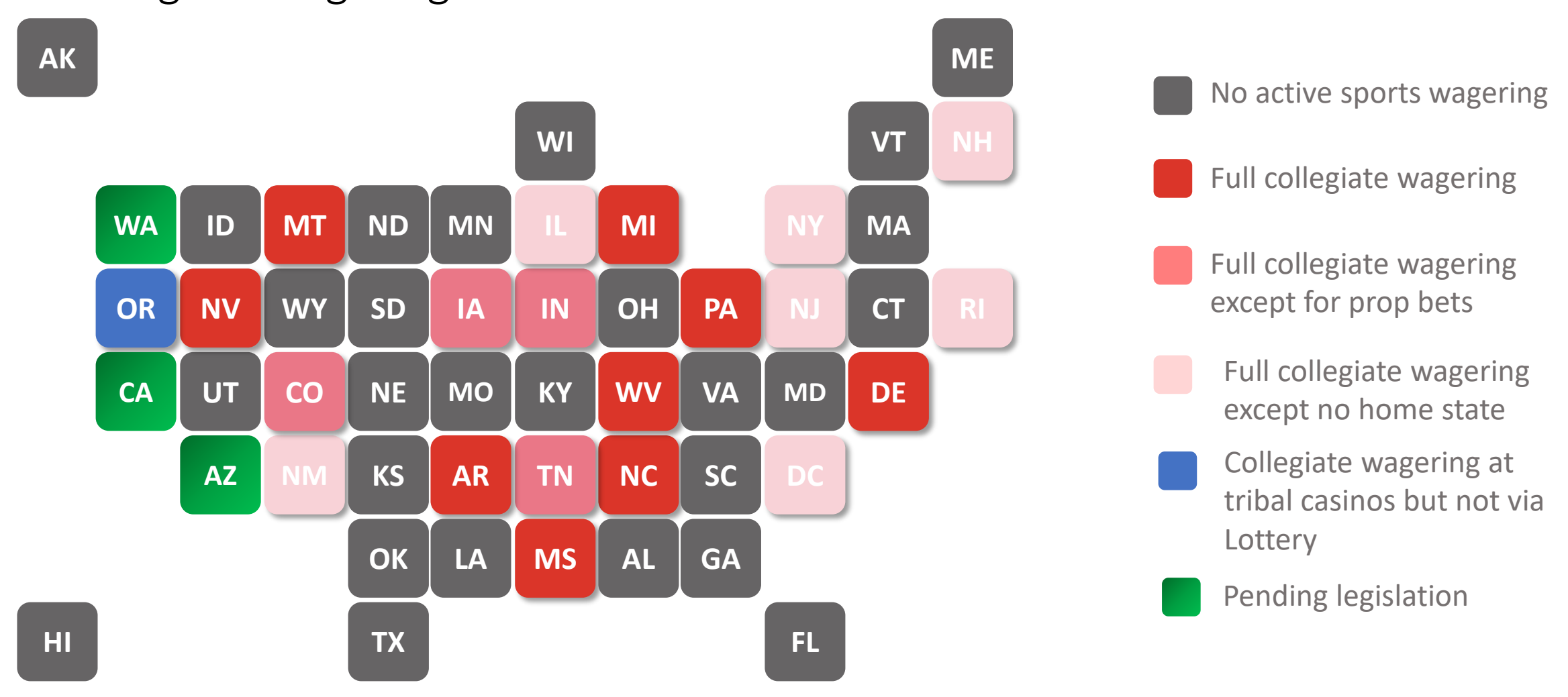
*CO, DC, IL, MI, MT, NC, TN – regulations/legislation passed; launch pending

Oregon Lottery is the only regulated sportsbook that does not offer any collegiate wagering