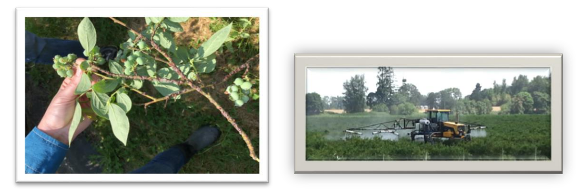
Figure 1. Repeated sprays for Drosophila suzukii has resulted in severe scale insect breakouts in in Oregon blueberries. Scale insects are notoriously difficult to control with insecticides, necessitating alternative controls including biocontrol (Lee et al 2019).

Since the arrival of Spotted-Wing Drosophila (SWD) in 2009, the cherry industry has needed to revert back to weekly sprays thus losing the biorational control of Western Cherry Fruit Fly by attract-and kill. SWD has fundamentally changed the business model of affected industries, but it has also resulted in a significant reduction in the quality of life of agriculturists. It is imperative that the fruit industry has effective tools to protect against new invasive pests. The loss of attract-and-kill in cherries has resulted in IPM programs that basically just rely on calendar sprays of insecticides. In many cases, growers acted in order to protect their crops, resulting in rejections of fruit because of Minimum Residue Levels (MRL's) that were exceeded in countries where fruit are exported. For blueberry, raspberry, and blackberry growers have gone from one insecticide spray per season to an average of seven (Figure 1).