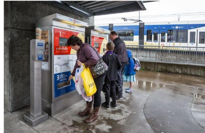
TriMet passengers purchase tickets before boarding a MAX train.

Board of Directors passes ordinance that failed to receive unanimous support at previous meeting.