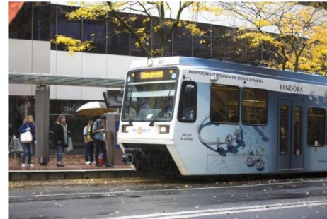
A TriMet MAX train in a file photo

Updated Jan 29, 2019; Posted Sep 21, 2018