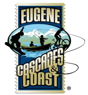
RAVEL LANE COUNTY