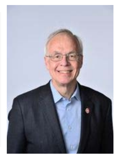
Dr. Bud Pierce

Raising the price of tobacco products through regular, significant tax increases is one of the most effective ways to help people quit and keep kids from becoming addicted.