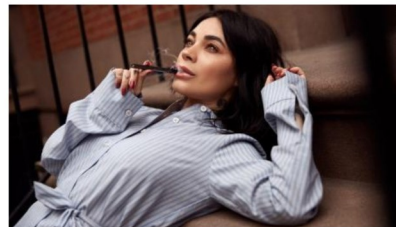
CNN investigates Juul's social media practices 02:28

(CNN) — Most of what we know about nicotine addiction in teens,