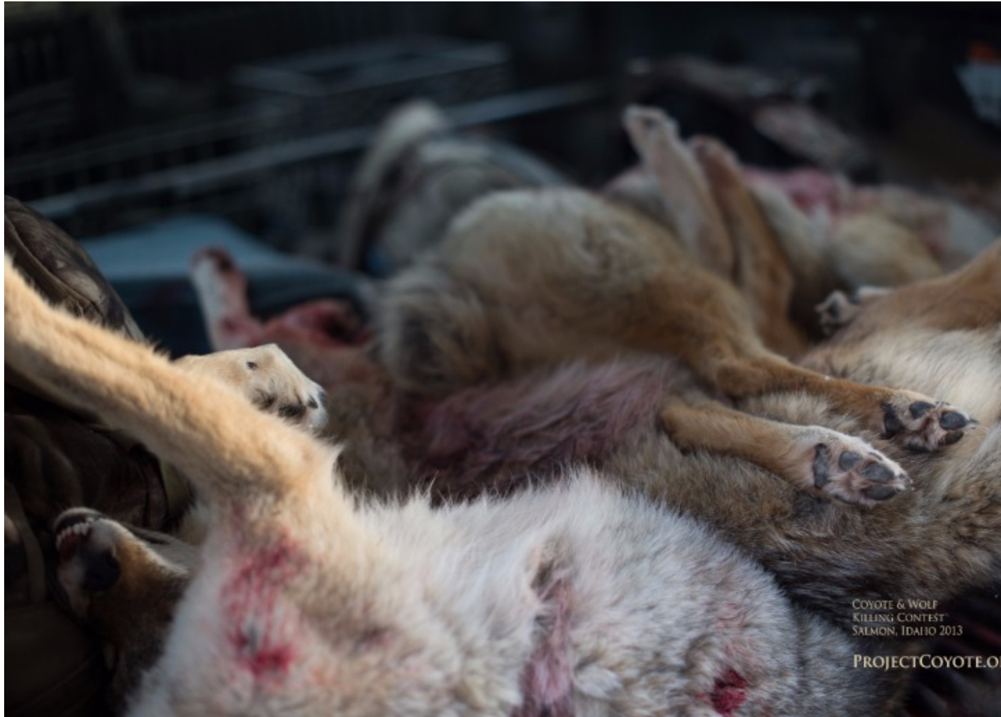
A pile of coyotes in the bed of a pick-up truck at a coyote-killing contest in Idaho a few years ago.

He then shared this insight: “Please keep in mind that these are opinions I have formed over several years of participating in calling contests. I would never discourage anyone from attending any contest, but I do believe it’s important to know in advance what you’re getting into. Several years ago my close friend and I attended a calling contest. We assumed it was just that, a ‘calling’ contest. We had 24 hours of the best hunting I’ve ever experienced. We killed five coyotes and six fox in 24 hours. We were surprised to learn that another team had killed 13 critters in the same period of time. We were even more surprised to learn that they had used snowmobiles and not predator calls to harvest these animals. I have nothing against any method of coyote hunting; it’s personal preference. However, comparing coyote calling to chasing them on snowmobiles is like comparing apples and oranges. I should have better understood the rules, or lack thereof.”