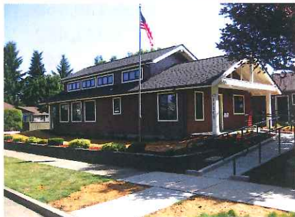
The Village, Monmouth

In every corner of Oregon, from Astoria to Ontario, from Brookings to Pendleton, apartment homes have been built to make sure families, seniors, and people with disabilities have safe, stable, and affordable housing. Over the years, we've built thousands of affordable apartment homes in towns and cities across Oregon. Some of these affordable apartment homes were built by private owners using resources from the federal government, including rental assistance which helps households with low incomes to pay the rent every month. In many of our smaller communities, these buildings are the only affordable apartment homes available.