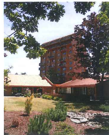
Robert Lindsey Tower, Salem

The Oregon Housing Alliance is requesting that the Legislature commit $100 million in Lottery Bonds through HB 5030 to help make sure we keep these important apartment homes. These resources will help make sure the housing remains decent and affordable for another generation.