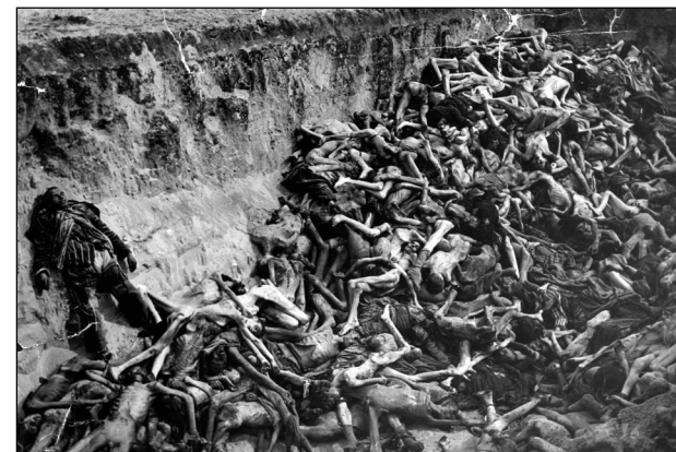
Mass grave of typhus victims in Bergen-Belsen concentration camp. Picture taken by British troops in spring of 1945.