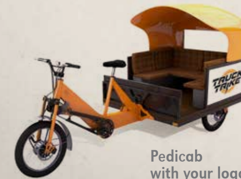
Pedicab with your logo