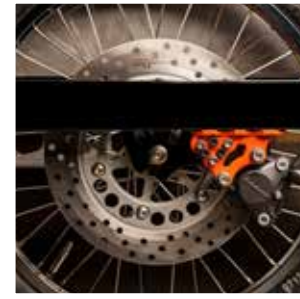
Heavy Duty Brakes

The bed of the Truck Trike comes standard with a phenolic plywood floor, providing a flat, durable, easy-to-clean surface that's an excellent foundation for any number of options from delivery to landscape maintenance, with everything in between. It also features a low floor for increased cargo capacity and optimum stability.