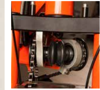
Front Pedal System

Unlike bicycle brakes, the motorcycle-based rear brakes are equipped with huge disks that were engineered for increased safety and stopping power even when hauling heavy loads.