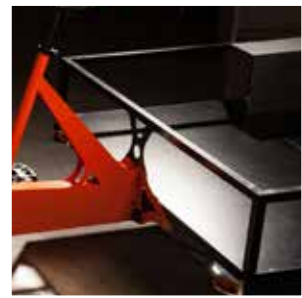
Versatile Cargo Bay

Unlike other trikes, the human powered component is completely separate from the electric-powered, meaning you can run only by pedal, or only electric, or any combination. Encounter a big hill? Twist the throttle and feel the surge of electric power push you up the hill. With this unique design, the driver can vary the mix of power sources for varying terrain and loads on a real time basis. This leads to unprecedented efficiency.