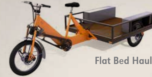
Flat Bed Hauler