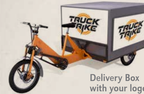
Delivery Box with your logo